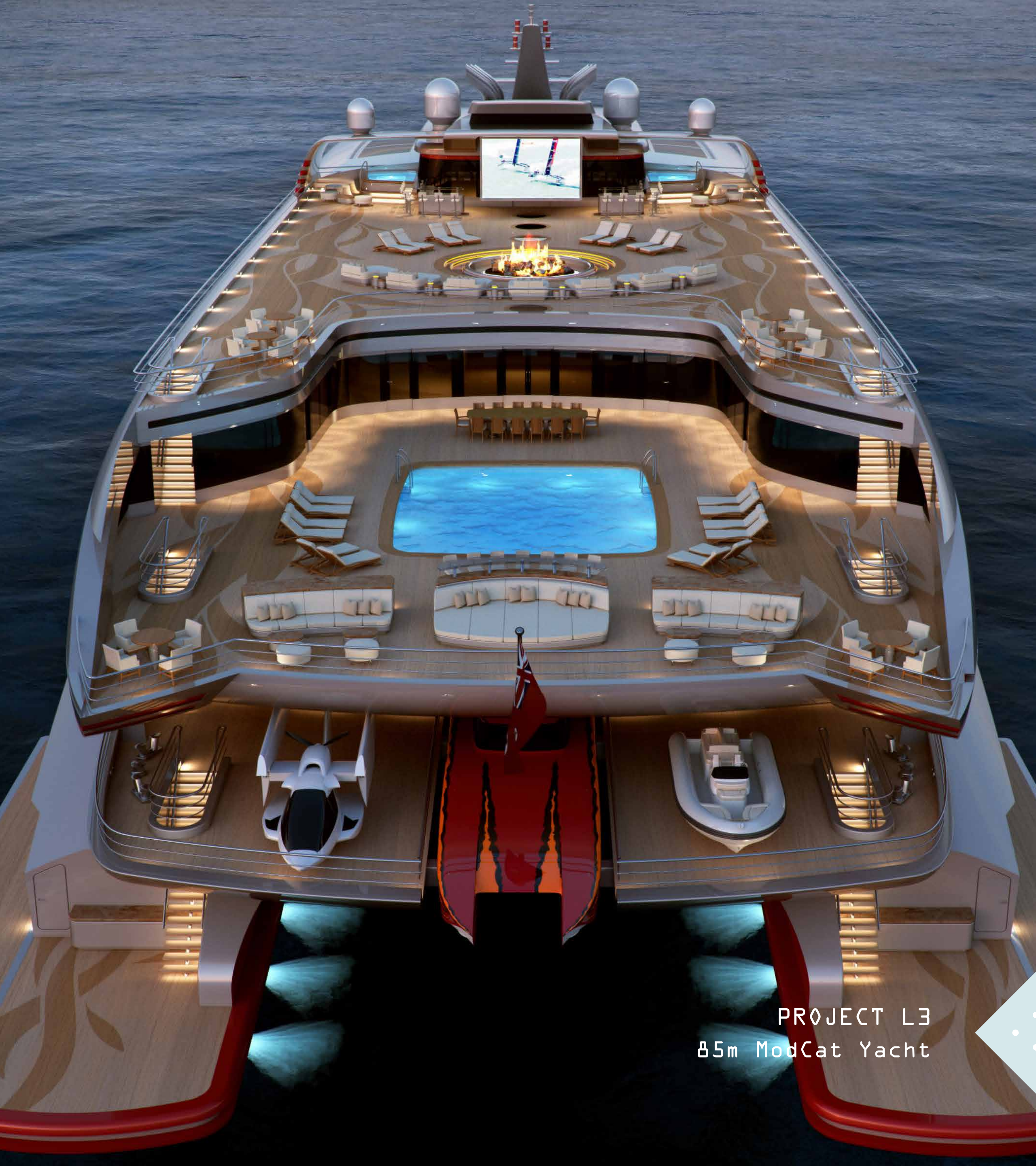
PROJECT L3 85m ModCat Yacht